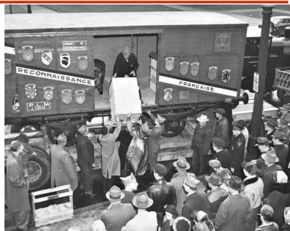
Small seedling trees, carefully packed in French soil and straw, were in the first box unloaded from the 40 & 8 car of the Merci Train at the Indiana World War Memorial on Feb. 13, 1949.

The website www.mercitrain.org was created to help others learn about the great story of the French Gratitude Train of 1949, commonly referred to as the Merci Train.